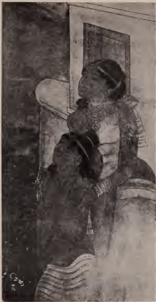
ADORATION GROUP; MOTHER AND CHILD BEFORE BUDDHA. FRESCO FROM AJANTA, CAVE 17 (SIXTH CENTURY).